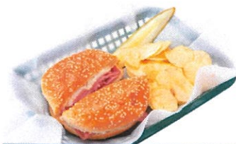
Ham & Cheese

Zesty sausage, pepperoni, cheese, onion, jalapenos & nacho cheese sauce..... 7.29 10.79